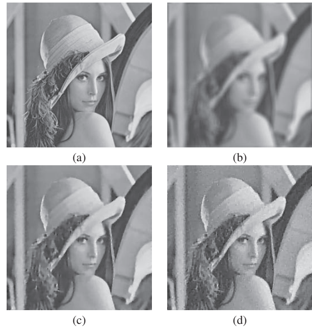
Fig. 2. (a) Original Lena image, (b) Image degraded by a 9 \times 9 uniform PSF and BSNR=30dB, (c) Restored image using the proposed algorithm (ISNR = 6.24dB), (d) Restored image using the IRLS method with p = 0.8 (ISNR = 5.96dB).

In this paper we presented a novel Bayesian algorithm for image restoration and parameter estimation using independent Gaussian image priors placed on high-pass filter outputs of the image. We adopt a fully-Bayesian analysis to jointly estimate the original image and the unknown hyperparameters (including the observation noise) such that no parameter tuning is necessary. We have shown that the proposed formulation is a special case of the non-convex l_p -norm based image priors with p = 0 , but it results in a convex optimization problem. Finally, we demonstrated with experimental results that the proposed algorithm provides higher restoration performance than state-of-the-art algorithms in most cases. Future work includes utilizing more complex high-pass filters and extending the framework to blind deconvolution.